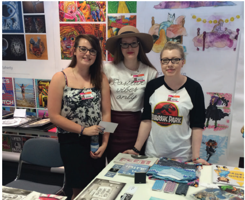
Sunderland University Students at the New Designers show in London