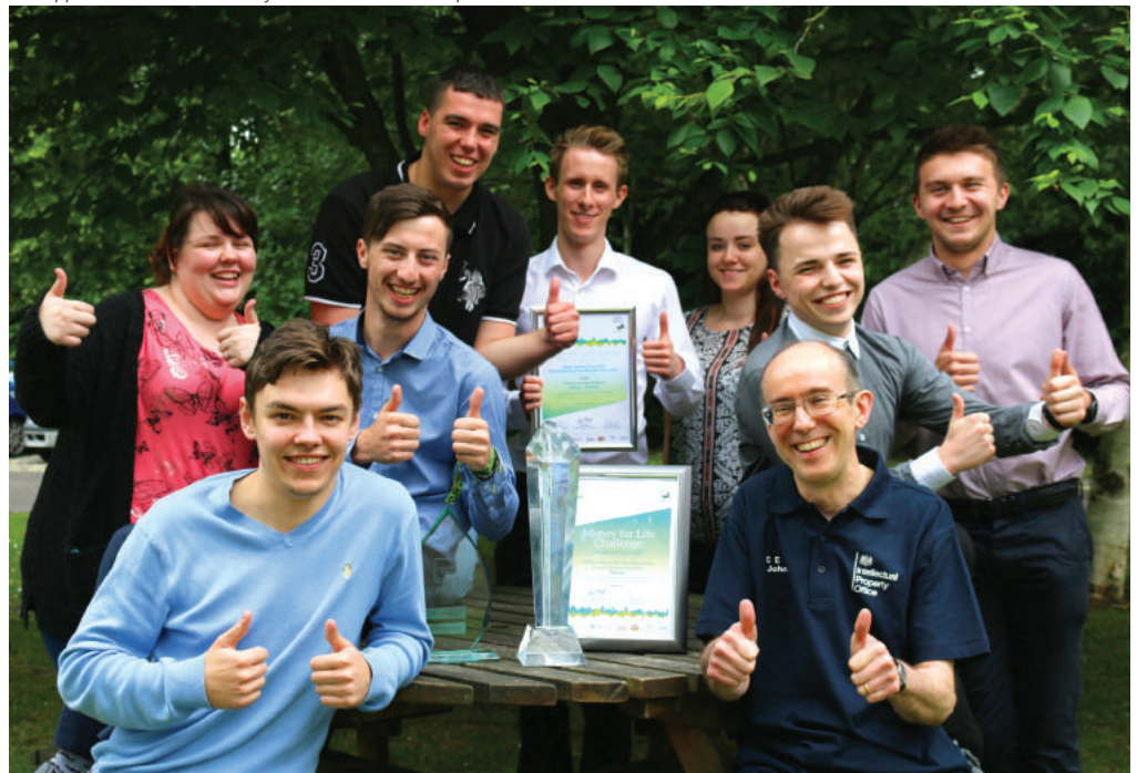
IPO Apprentices crowned Money for Life National Champions 2015