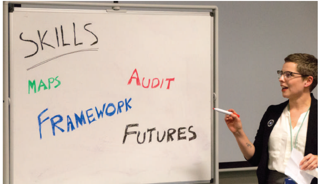
IPO staff workshops