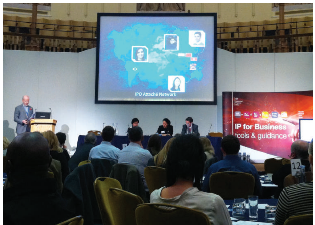
IP Attachés at an IP Business Advisor Conference in London