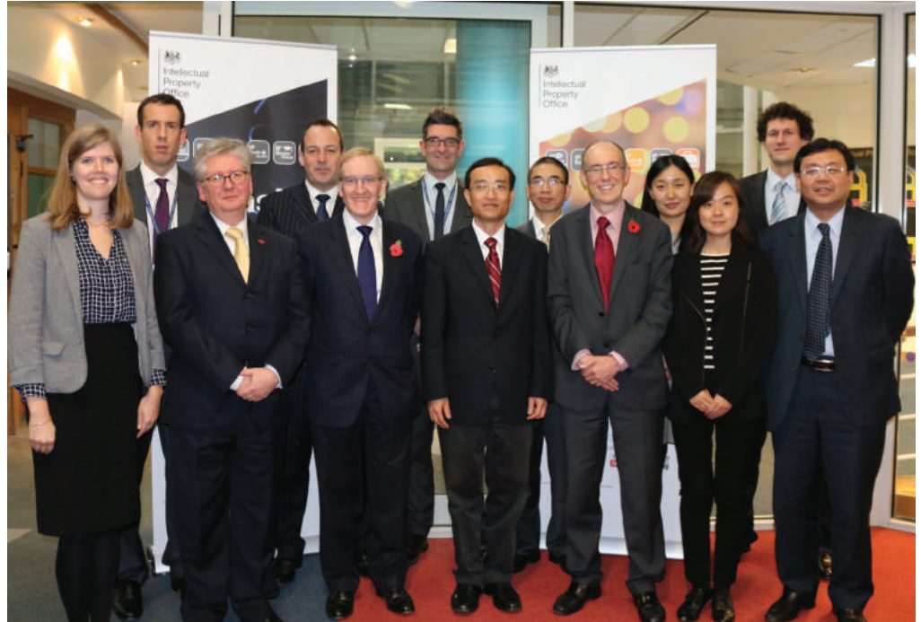
The IPO welcomes a delegation from the Chinese State Intellectual Property Office'

may also need advice about exports or development funding, for example. We want to be able to help them identify and access these services in as seamless a way as possible. This means really understanding their journeys, not just through the IP part of their business development, but more widely.