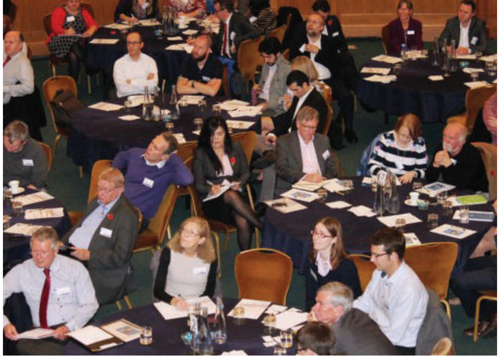
International IP Enforcement Summit, June 2014 in London, jointly hosted between the IPO, OHIM and EU Commission