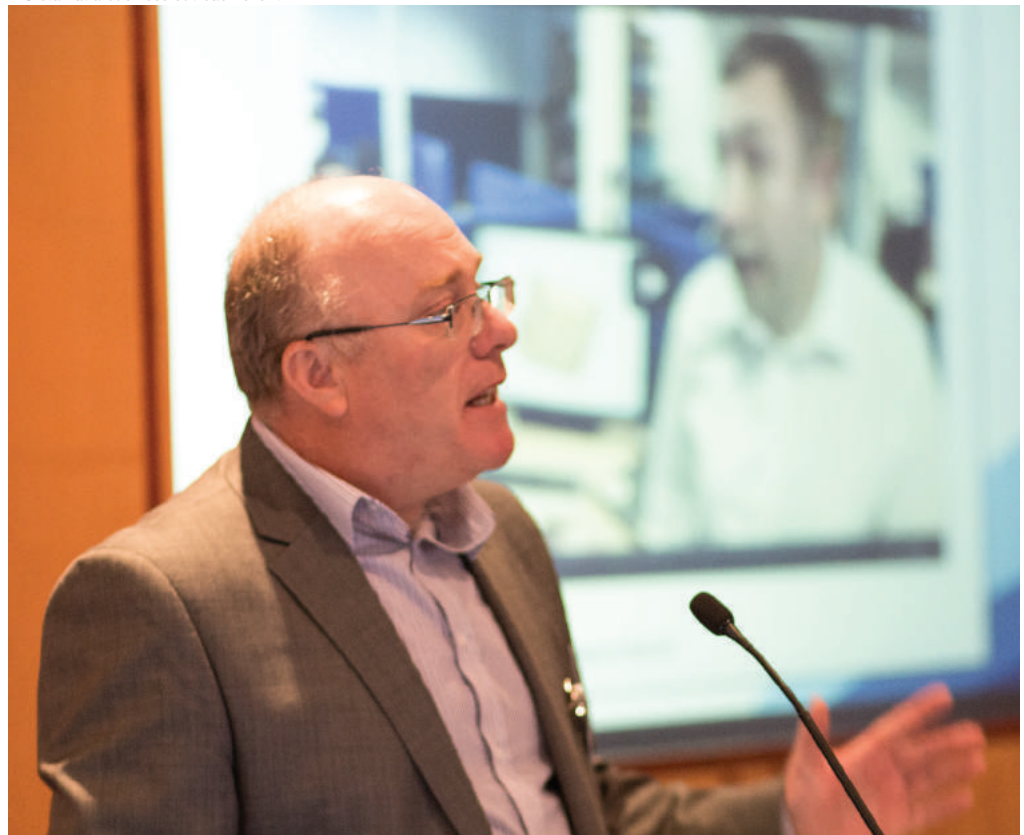
IPO staff at a business outreach event