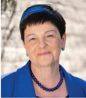
Baroness Neville-Rolfe, DBE, CMG Minister for Intellectual Property